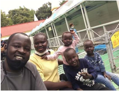
With Family in Japan, 2020

My days at Yokohama National University remain some of the most memorable and life-changing moments of my journey. As a civil engineering student, I found myself in an environment that nurtured both academic growth and personal development. The lectures were inspiring, the research facilities world-class, and the friendships I built with colleagues from different countries are unforgettable. Life in Yokohama was equally rewarding, balancing studies with cultural discovery and family life.