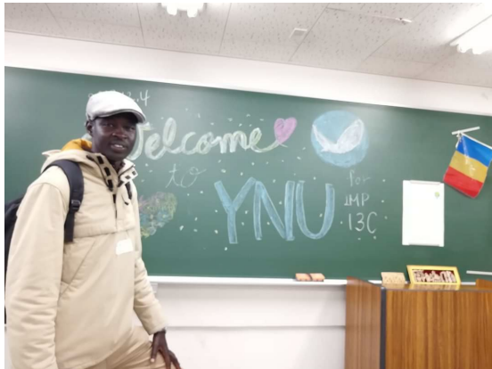
Welcoming Party of the IMP 13 th Cohort