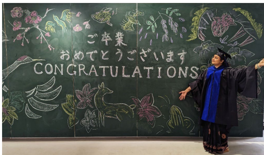
At the YNU Graduation Ceremony

To current students, I would say this: cherish your time at YNU. Learn with curiosity, question with humility, and embrace every challenge as preparation for the journey ahead. The lessons you absorb here will travel with you far beyond the campus gates. And as a bonus, our beloved campus has one of the most beautiful cherry blossoms.